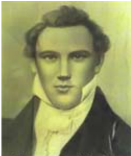
Joseph Smith, Jr.

Any attempt to summarize recent developments in the Church of Jesus Christ of Latter Day Saints (LDS) must be selective, for the organization is immense, its teachings complex, and its